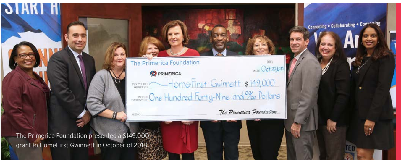
The Primerica Foundation presented a $149,000 grant to HomeFirst Gwinnett in October of 2018.

The coordinated entry system helps those in need better navigate the services available in the county. Multiple assessment centers will be built in central locations across the county and will include on-site shelters to provide immediate housing assistance to those awaiting longer-term help.